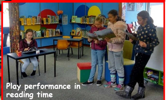
Play performance in reading time